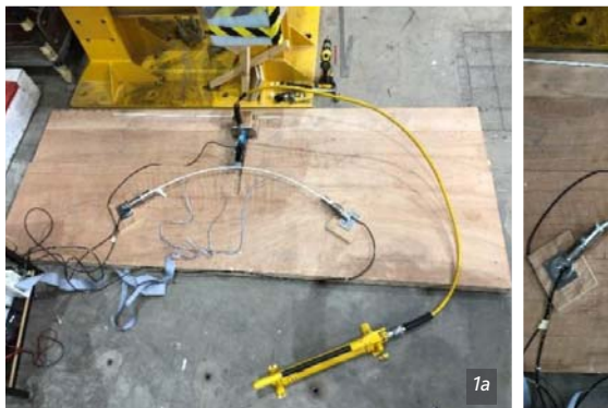
Figure 1a-b. Experimental setup for the point loading test